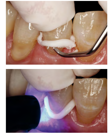
Quick and easy clean-up in the gel phase